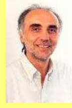
Giovanni Bidoglio Joint Research Centre, Italy